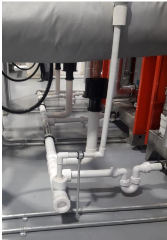
Figure18: Plant room Condensate Example

The condensate drain shall be a minimum of 40 mm (Corrosion Resistant) and shall be routed to the foul drain location.