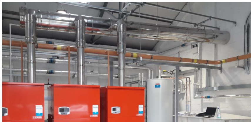
Figure17: Plant Room Flue example

A draught diverter shall be fitted on the main horizontal (c/w 3degree inclination) as per the Manufacturer’s recommendations.